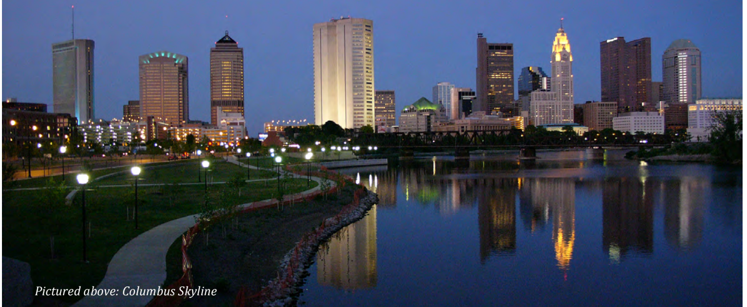
Pictured above: Columbus Skyline