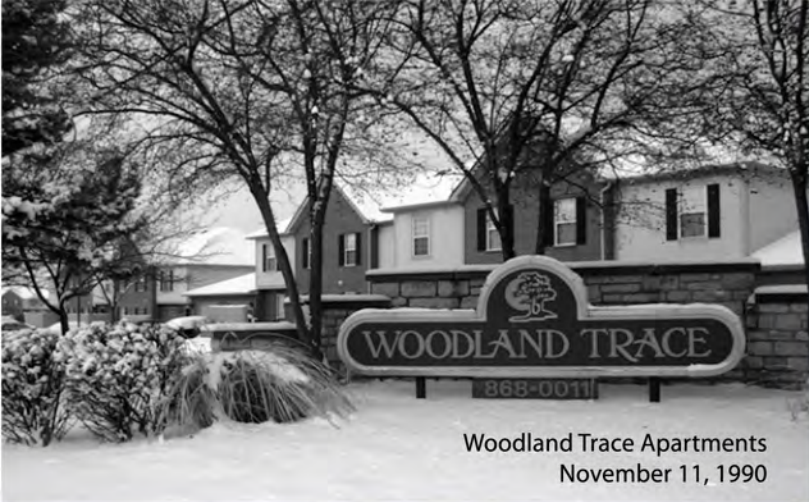
Woodland Trace Apartments November 11, 1990