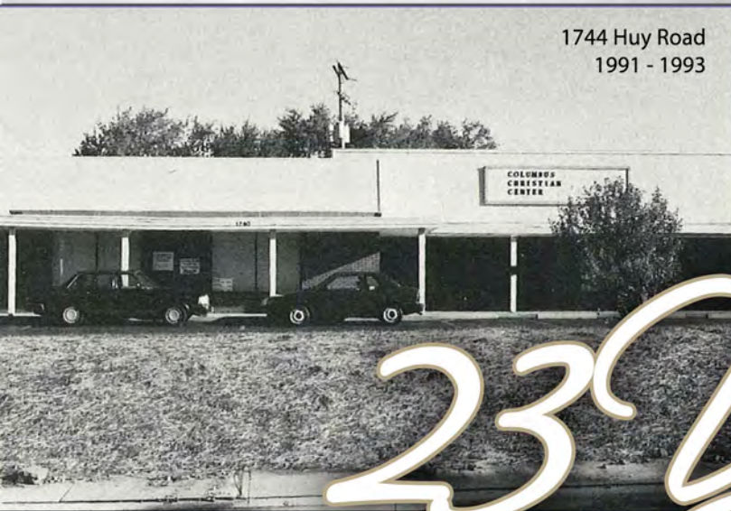
1744 Huy Road 1991 - 1993