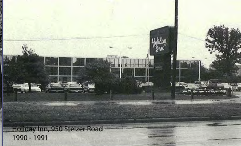
Holiday Inn, 950 Stelzer Road 1990 - 1991